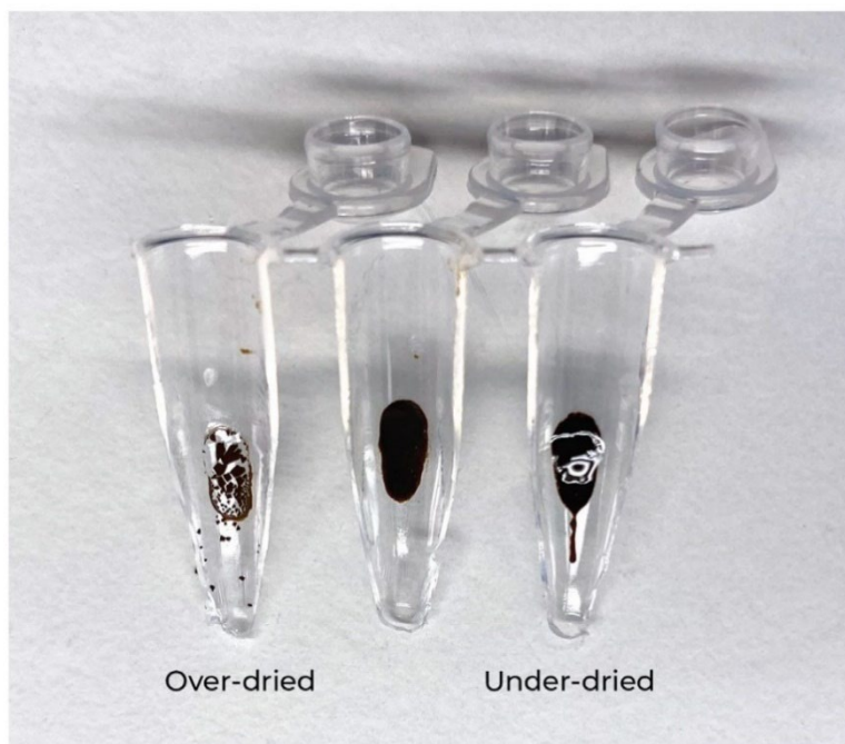
Figure 1. Over-dried beads are cracked and flakey, resembling dried mud. Under-dried beads are glossy and wet, like saturated mud. Optimally dried beads appear damp, but lack gloss.

Start with 5 minutes of air-dry time and adjust the time as needed to achieve optimally dried beads. Wash buffer carryover from insufficiently dried beads or overdried, cracked beads may reduce nucleic acid recovery.