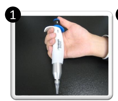
Attach FUNA-GEL TIP to Gel Pipette.