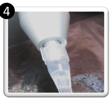
Release the gel strip by pushing plunger.