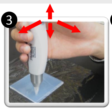
Push and move the head of GEL-TIP back and forth and around. Check the gel strip is inside of the TIP.