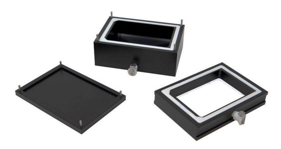
EZ-Vac 96<sup>™</sup> Vacuum Manifold

The EZ-Vac 96<sup>™</sup> Vacuum Manifold features durable chemical resistant construction and is designed for the high-throughput, rapid parallel purification of nucleic acid using the ZymoPURE<sup>™</sup> 96 Plasmid Miniprep Kit. The vacuum manifold allows researchers to simplify their high-throughput nucleic acid purification workflows further by eliminating the need for multiple centrifugation steps and disposal of flow-through from collection plates. The unique manifold design also conveniently allows the filtrate and wash solutions to be collected in an external catch flask (not provided), eliminating the need for manifold disassembly and waste removal during the purification process.