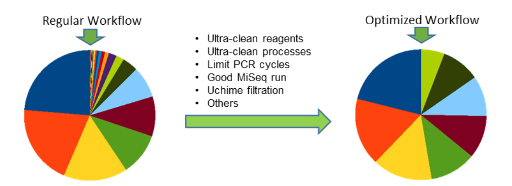
Figure 2. Eliminating noise/false positives in 16S rRNA gene targeted sequencing guided with ZymoBlOMICS™ Microbial Community DNA Standard. The pie chart on the left is the microbial composition profile of the standard determined by a regular workflow of 16S sequencing using primers targeting 16S v3-4 region. The pie chart on the right is the profile of the same standard determined using the same primer sets, but with an optimized in-house 16S sequencing workflow. Noise observed on the left panel were mainly caused by PCR chimera, process contamination, and reagent contamination, which were controlled in the optimized workflow. The accuracy of the standard's microbial composition is critical for revealing the presence of composition bias and false positives when optimizing a workflow.