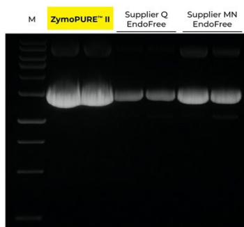
Up to 6x More Concentrated Plasmid