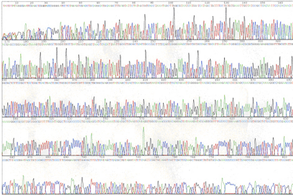
Sequencing chromatogram of pGEM® DNA generated using an ABI 3730xl DNA analyzer. DNA was labeled with ABI BigDye v3.1 terminators and cleaned using the ZR DNA Sequencing Clean-up Kit™.