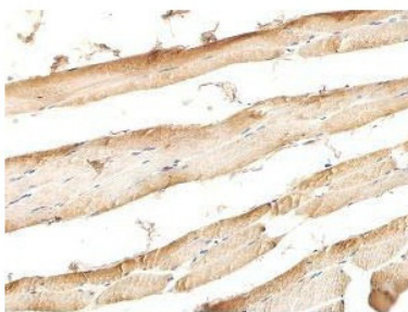
Immunohistochemical staining of formalin-fixed paraffin-embedded fetal skeletal muscle showing cytoplasmic staining with anti-EAPP antibody at a dilution of 1/100