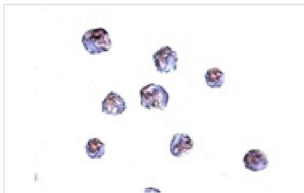
Immunocytochemistry of IRGC in A20 cells with IRGC antibody at 5 ug/mL.