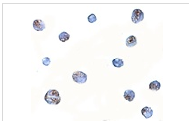
Immunocytochemistry of Norrin in Jurkat cells with Norrin antibody at 5 ug/mL.