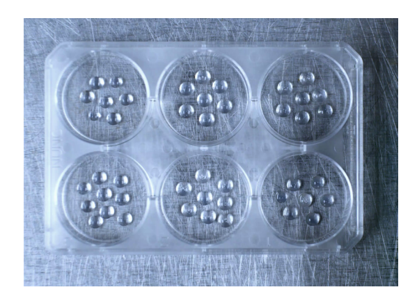
Figure 1. Cultrex UltiMatrix RGF BME Domes. Cultrex UltiMatrix BME was diluted to 8 mg/mL using ice-cold culture medium and dispensed as 50 \mu L domes.