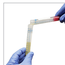
Fig. e - Collect cells