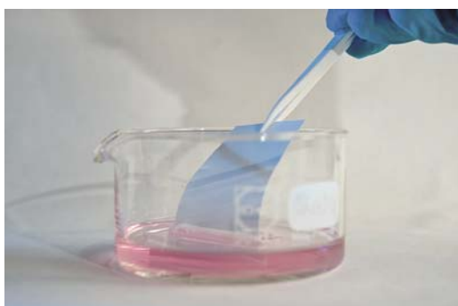
Figure 2. Submerge membrane in SpeedBlot (His)