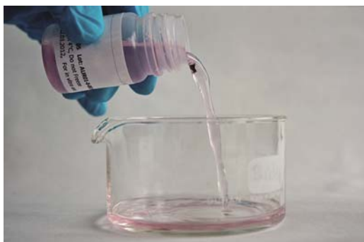
Figure 1. Pour SpeedBlot (His) into suitable container