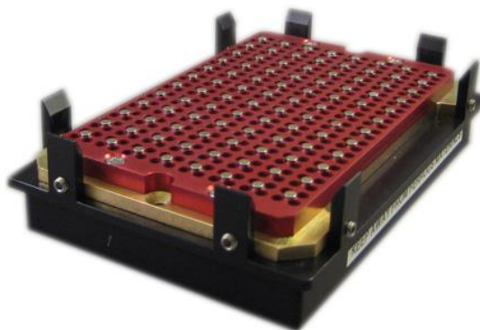
Figure 3: Magnetic Separator 384 SBS

The product is suitable for most 384-well PCR plates, both semi- and full-skirted as well as non-skirted, and for most 384-well microplates.