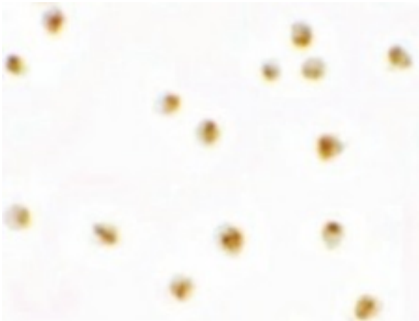
Immunocytochemistry of PIERCE1 in A20 cells with PIERCE1 antibody at 2.5 ug/ml.