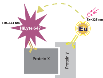
Figure 1. Schematic representation of TR-FRET energy transfer from Eu-labeled donor to HiLyte™ Fluor 647-labeled acceptor.

An important condition for TR-FRET measurement is the short distance between donor and acceptor molecules (up to 100 Å). Since TR-FRET requires proximity of donor and acceptor to occur, it becomes an important tool in assay development for studies of protein-protein, protein-peptide interactions, biomarkers and analytes. Since all these assays are performed in homogenous formats they are ideal tools for HTS.