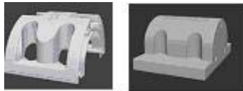
Sample holder Magnetic base Steel rod (7 units)

ADEMTECH SA Parc Scientifique Unitec 1 ; 4 Allée du Doyen Georges Brus ; 33600 Pessac France