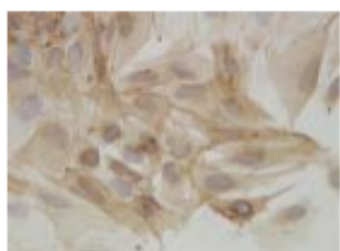
Rat MFH culture cell line (MT-9)