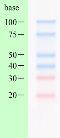
DynaMarker® Prestain Marker for Small RNA Plus

Figure 1. Electrophoresis profile of DynaMarker® Prestain Marker for Small RNA Plus (5 µl) on 10 % polyacrylamide – 7.5 M urea gel / 1 × TBE buffer as running buffer.