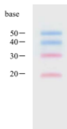
DynaMarker® Prestain Marker for Small RNA

Figure 1. Electrophoresis profile of DynaMarker® Prestain Marker for Small RNA (5 µl) on 12.5 % acrylamide – 7.5 M urea gel / 1 × TBE buffer as running buffer.