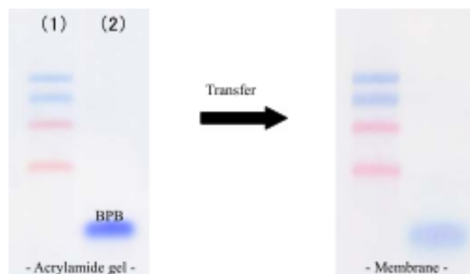
Figure 3. Left : Electrophoresis profile of (1) DynaMarker Prestain Marker for Small RNA and (2) RNA sample on 12.5 % acrylamide – 7.5 M urea gel / 1 \times TBE buffer as running buffer. Right : Blotting of (1) and (2) onto nylon membrane.