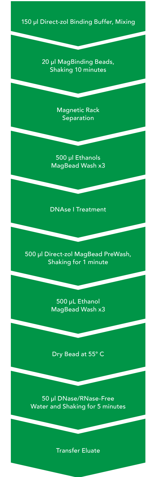
Figure 1: Zymo Direct-zol-96 MagBead RNA extraction workflow.