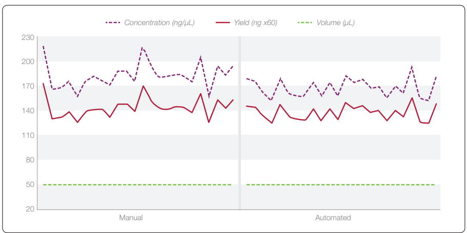
Figure 2: Comparison between manual and automated (Microlab STAR) sample processing using Direct-zol.

RNA concentration, recovered volume, and total RNA yields from replicate HeLa cells (5x10<sup>5</sup>/well) were compared between 24 manually processed samples and 24 samples processed on the Hamilton Microlab STAR. The results indicate that automation is comparable with the manual process (Figure 2).