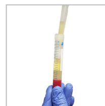
Fig. d - Remove plasma