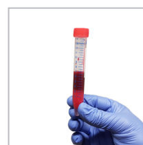
Fig. b - Before centrifugation