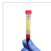
Fig. c - After centrifugation