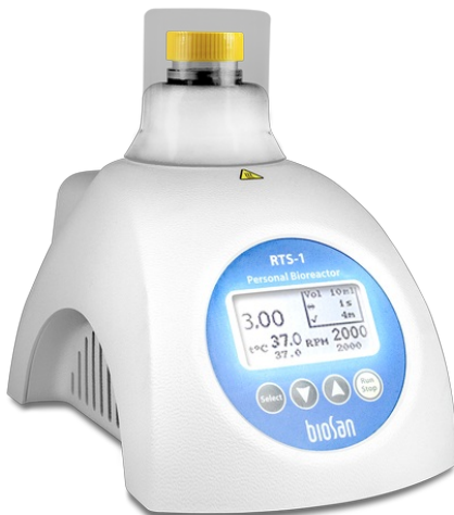
RTS-1 Including TPP TubeSpin® Bioreactor vessels 50ml, 20pcs Personal bioreactor