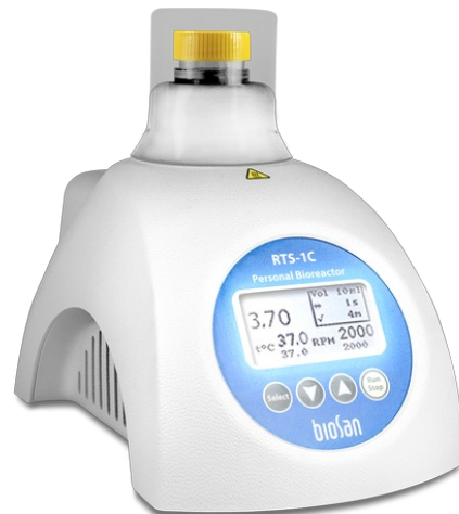
RTS-1C Including TPP TubeSpin® Bioreactor vessels 50ml, 20pcs Personal bioreactor